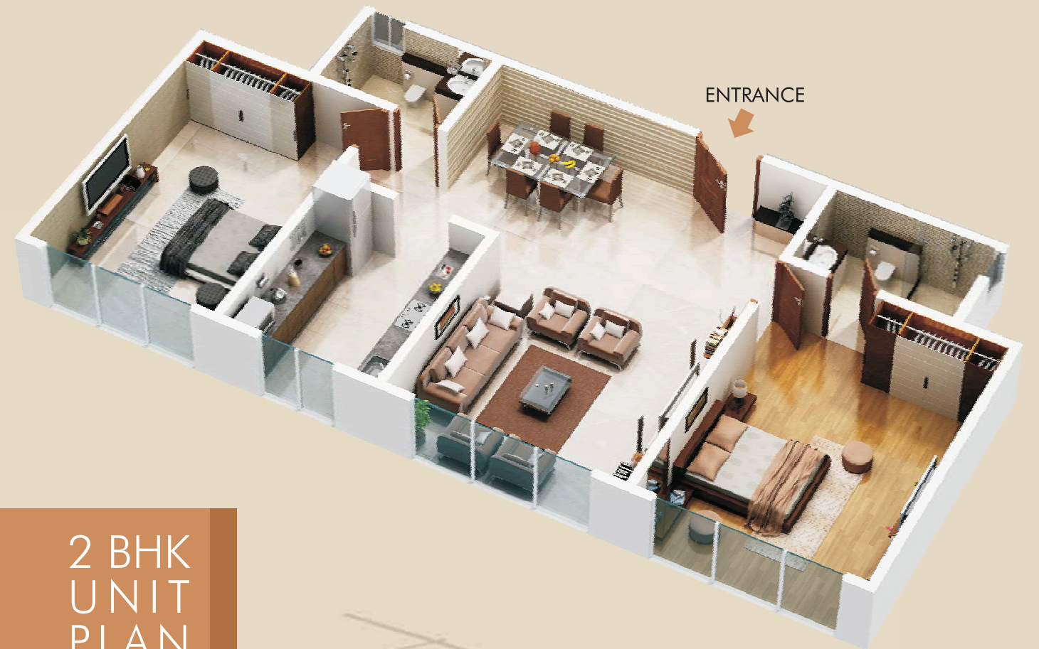
2 BHK UNIT PLAN