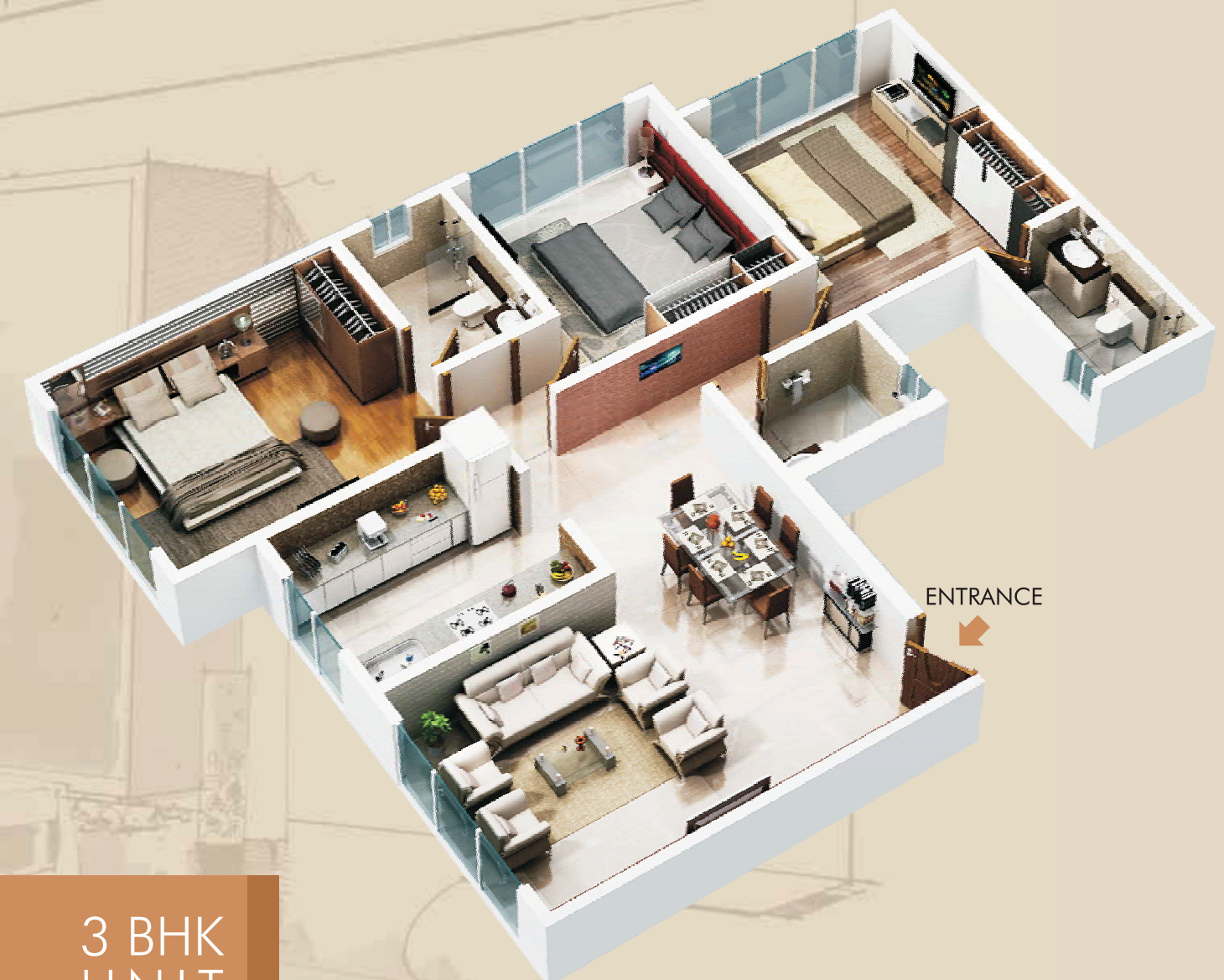
3 BHK UNIT PLAN